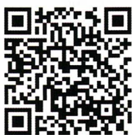
Cloud to access the Saalbach panoramic image via mobile.

P anomax is unique, not just because of the unbeaten quality of images but especially in combination with the Panomax marketing software which was specifically designed for tourism. Go to www.panomax.com to check out all 186 Panomax Cameras which are located all around the globe. The images delivered by Panomax say more than a thousand words and capture every user's attention.